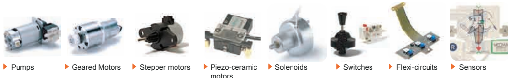
▶ Pumps ▶ Geared Motors ▶ Stepper motors ▶ Piezo-ceramic motors ▶ Solenoids ▶ Switches ▶ Flexi-circuits ▶ Sensors